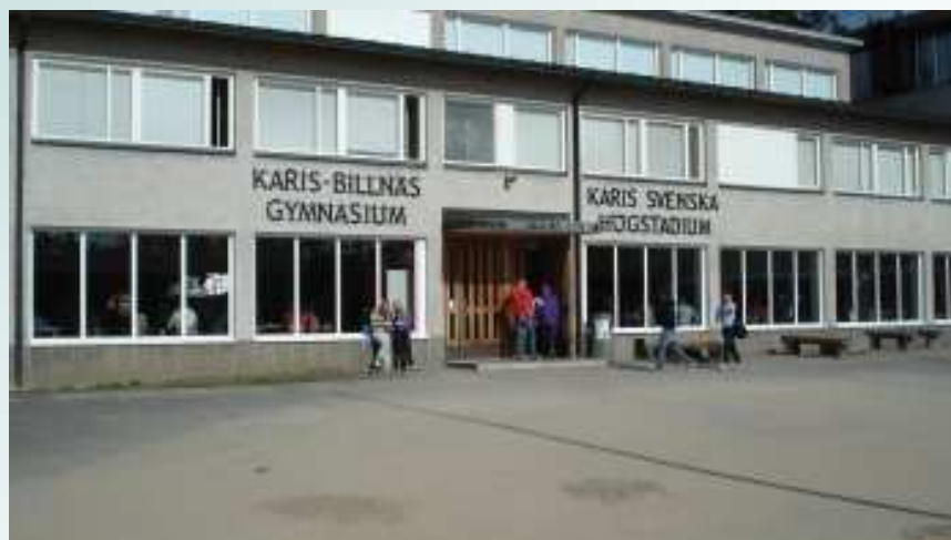
Karis svenska högstadium